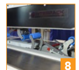
8 Offset tape heads process 2" high cases