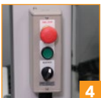
4 "Blocked" button for jams & replacing bottom tape roll