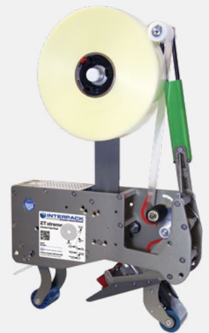
ET Xtreme™ Tape Head

Featured with the newly designed Interpack RSA case sealer is the next generation ET Xtreme™ tape head housing patented technology that safely provides optimal tape application and wipe down - even on recycled corrugate. Superior wipe down on each of the three taped panels is achieved with innovative design while minimizing force, thus, virtually eliminating crushed or damaged cases. When you compare features, benefits and value, Interpack Case Sealers are the right choice for your demanding job.