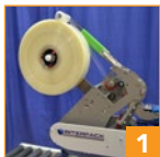
1 Tip-up tape head simplifies roll replacement