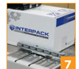
7 Horizontal centering guides with rollers