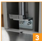
3 Selectable minimum height