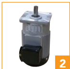
2 One 1/2 HP motor & one 1/4 HP motor