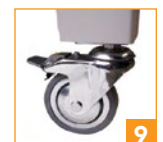
9 Optional swivel & locking casters