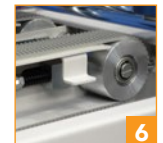
6 Self-tensioning & tracking drive belts simplify belt replacement