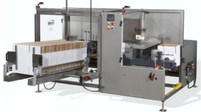
2-EZ® HS CASE ERECTOR Case Erector, Bottom Sealer