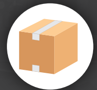
TOP & BOTTOM SEAL