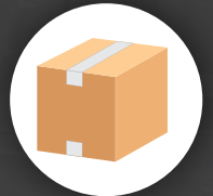
TOP & BOTTOM SEAL