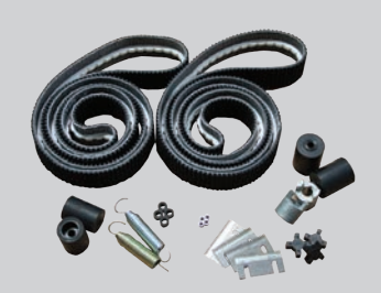
SPARE PARTS KIT "Spare Parts Kits may vary based on machine" Minimize downtime with BestPack's Spare Parts Kit.

This 39.5" long conveyor is a great work platform and allows for staging of cartons on the infeed and the exit.