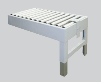
LONG INFEED/EXIT CONVEYOR W/ L-BRACKET STABILIZER

Order a spare tape head with your machine to minimize down time. Having a spare will allow you to drop in a tape head with a new roll of tape in no time!