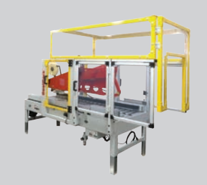
ADDITIONAL SAFETY GUARDING Add additional protective measures

that prevent workplace injuries with additional safety gates around your equipment.