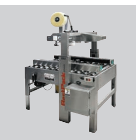
FOOD GRADE 304 STAINLESS STEEL This machine is available in 304 stainless steel which is food grade safe for food applications.