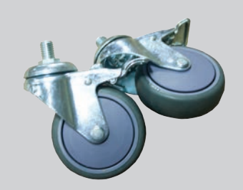
LOCKING CASTERS The heavy duty locking casters allow the carton sealer quick and easy mobility to other locations.