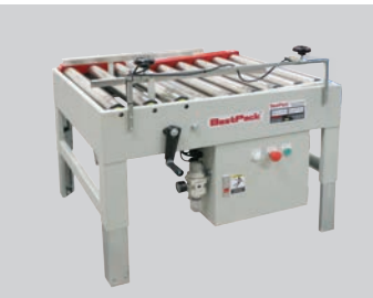
INDEXER STATION The indexer's function is to separate and time cartons going into the carton sealer.

that prevent workplace injuries with additional safety gates around your equipment.