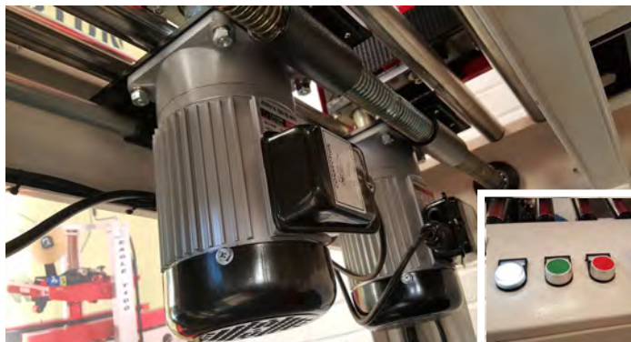
1/4HP Dual Industrial Motors