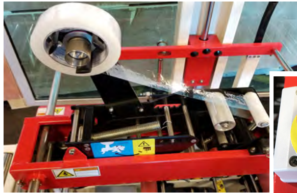
Top Tape Head