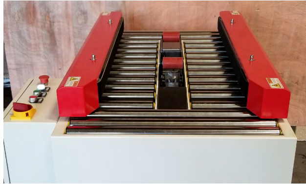
Side Belt Drive System