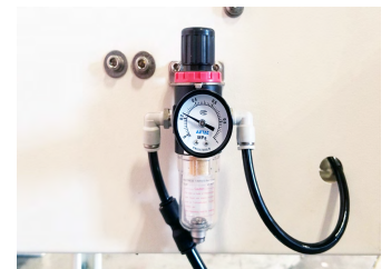
Air Pressure Controls