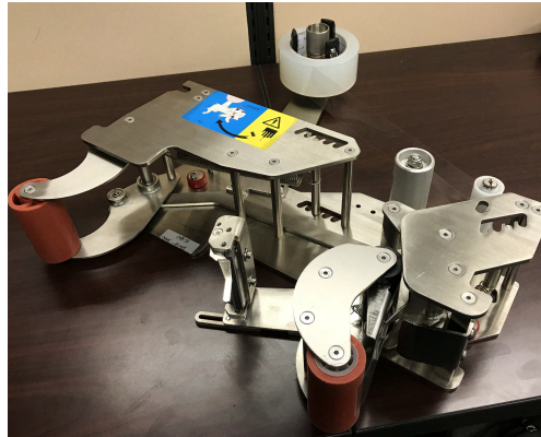
Tape Head Assembly