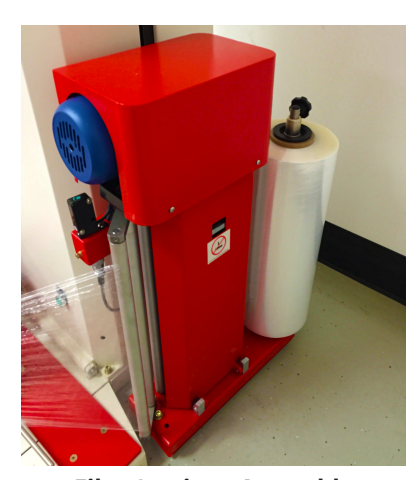
Film Carriage Assembly