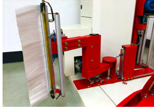
Automatic Film Cut and Wipe Arm