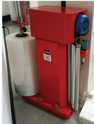
Film Carriage Assembly