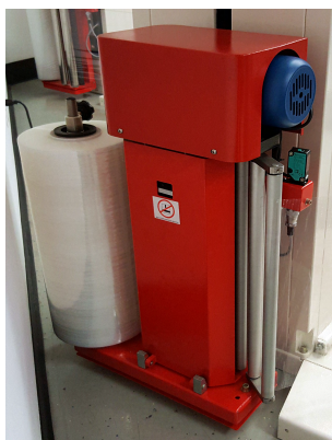
Film Carriage Assembly