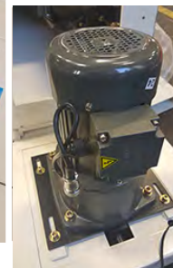
1HP Electric Motor