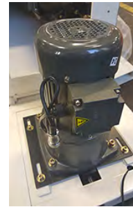
1HP Electric Motor