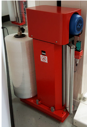
Film Carriage Assembly