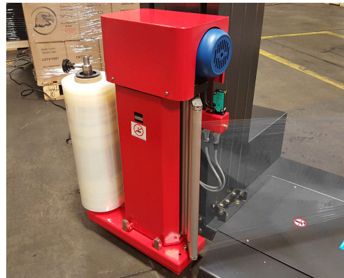
Film Carriage Assembly